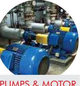
PUMPS & MOTOR